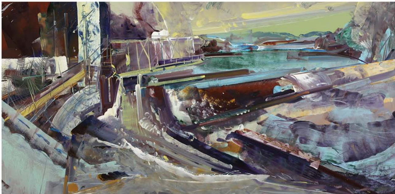
QUICK RISE IN THE RIVER, 35X70 INCHES, OIL ON GATORBOARD, 2011