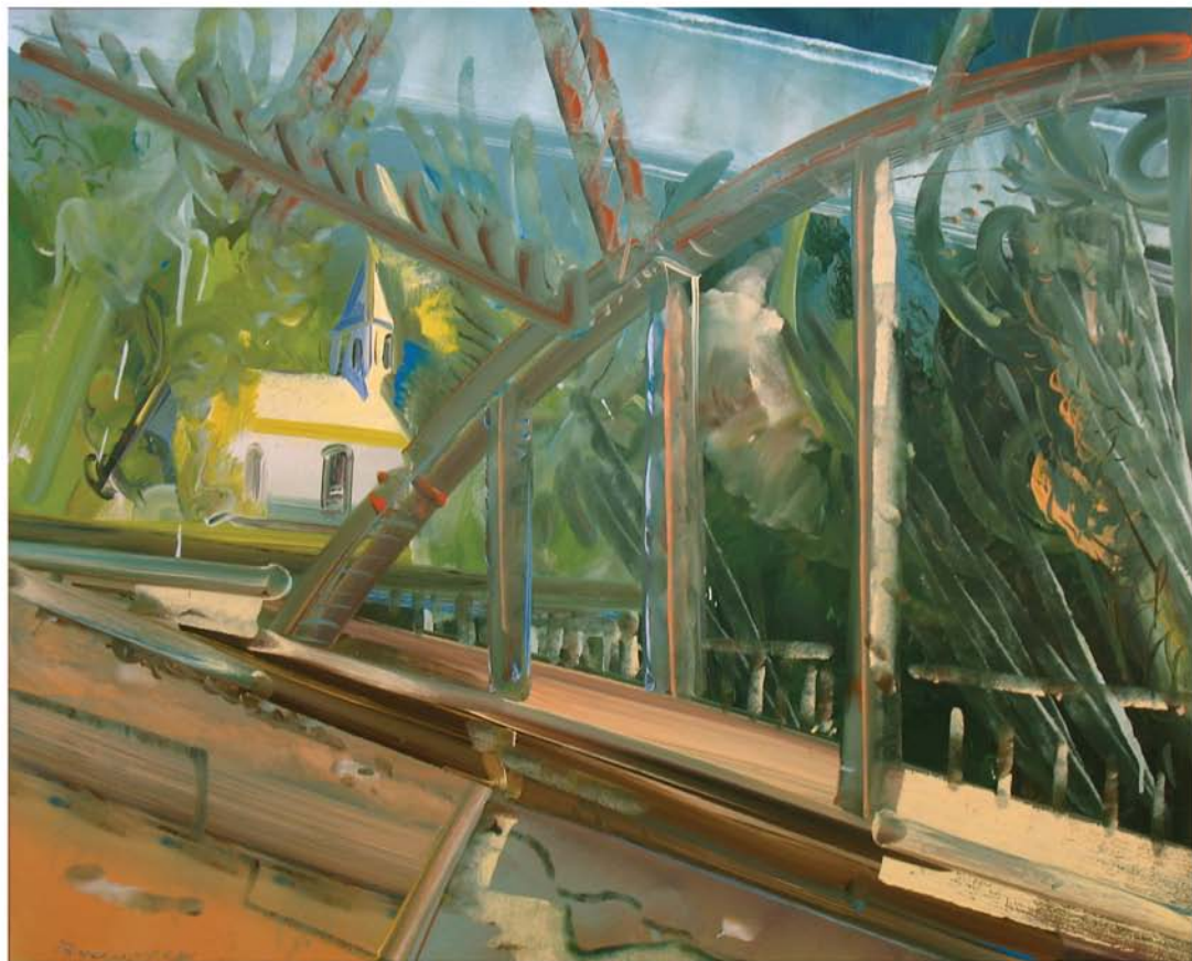
TRESSELLED SPIRE, 30X40 INCHES, OIL ON MI-TEINTES, 2010