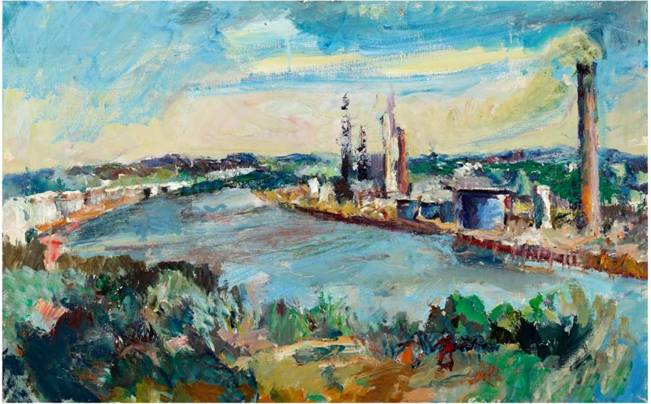
GEORGE PLATT BRIDGE VIEW, 23.75X38 INCHES, OIL ON LINEN, 1988