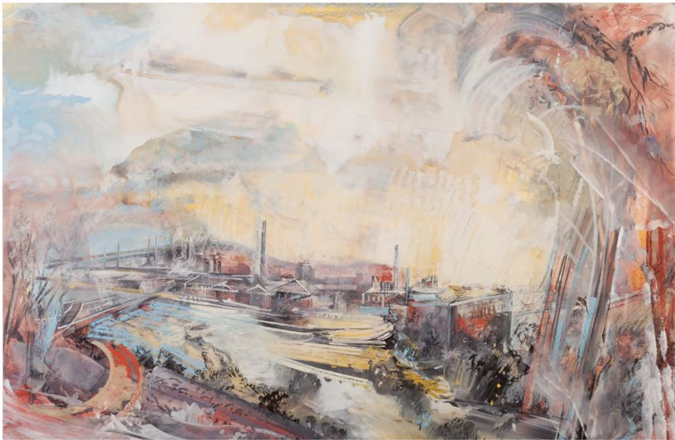
BETHLEHEM IRON COMPANY:VIEW FROM NISKY HILL ACROSS LEHIGH RIVER 1873, 40X60 INCHES, CHARCOAL & LIQUIFIED PASTEL ON MI-TEINTES, 2011