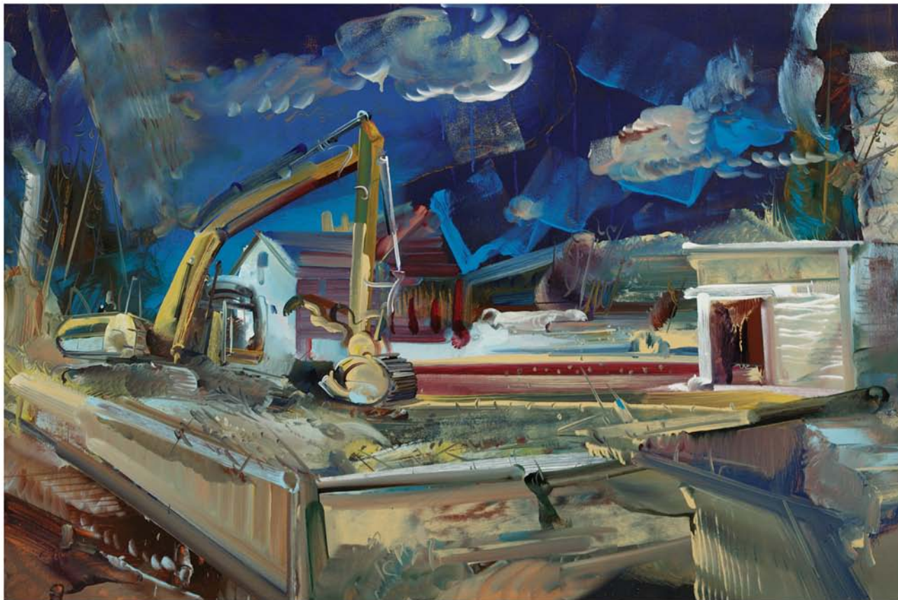
BARN FLATTENED TO THE GROUND, 40X48 INCHES, OIL ON MI-TEINTES, 2011