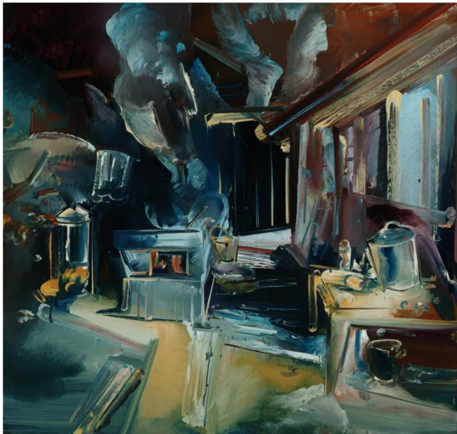
SUGAR STEAM, 32X32 INCHES, OIL ON MI-TEINTES, 2008