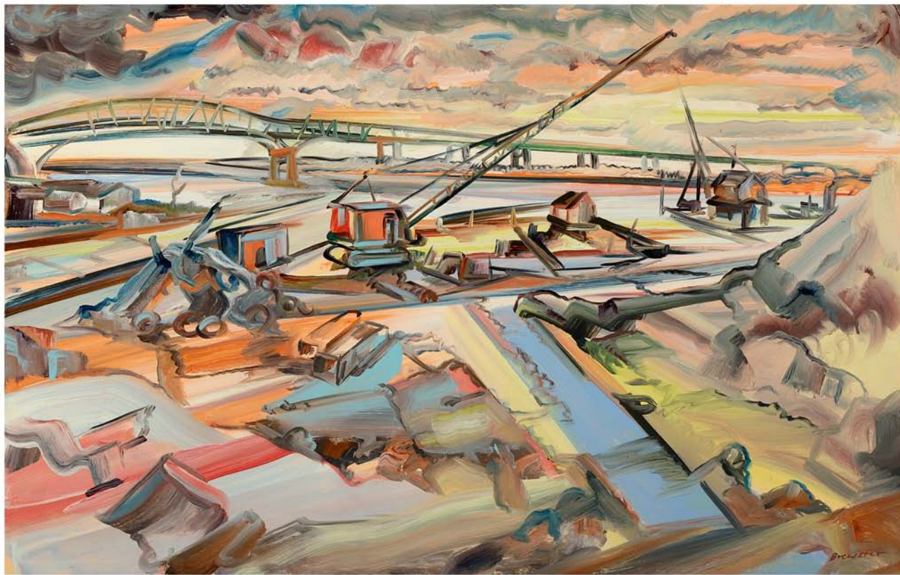
TIDEWATER CRANE, 28X44 INCHES, OIL ON LINEN, 1992