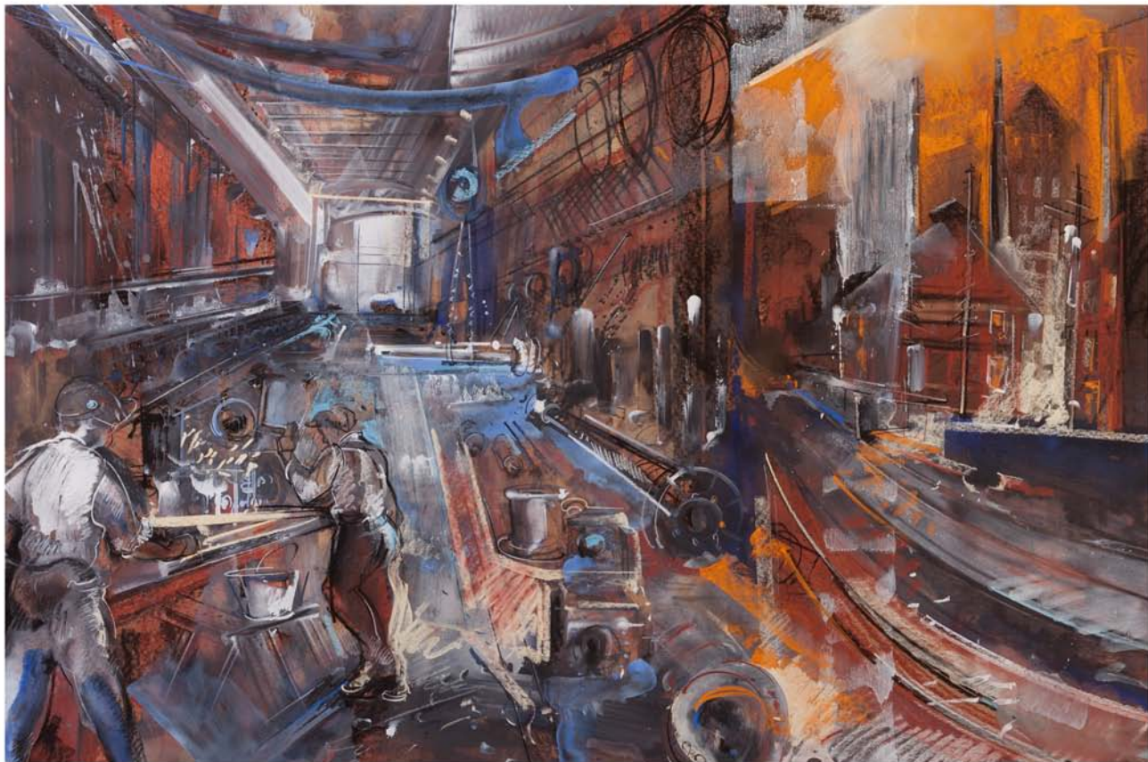
BETHELEHEM WORKMEN ON CASTING FLOOR 1882, 40X60 INCHES, CHARCOAL & LIQUIFIED PASTEL ON MI-TEINTES, 2011