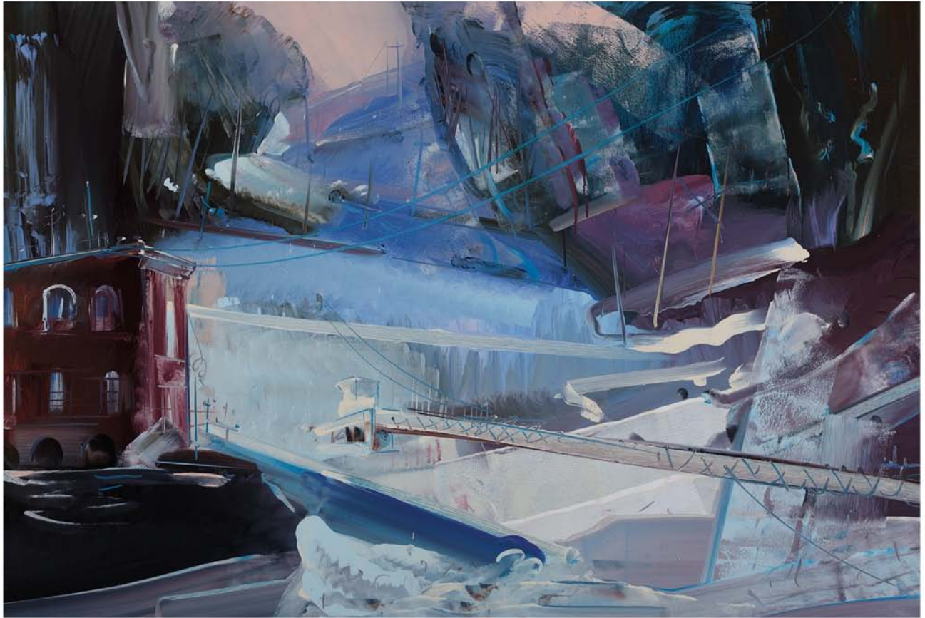
BLUE POWERLINE SWATH, 40X48 INCHES, OIL ON MI-TEINTES, 2011