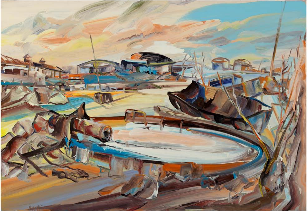
LIFEBOAT AND THICK WASTE OIL, 36X52 INCHES, OIL ON LINEN, 1993