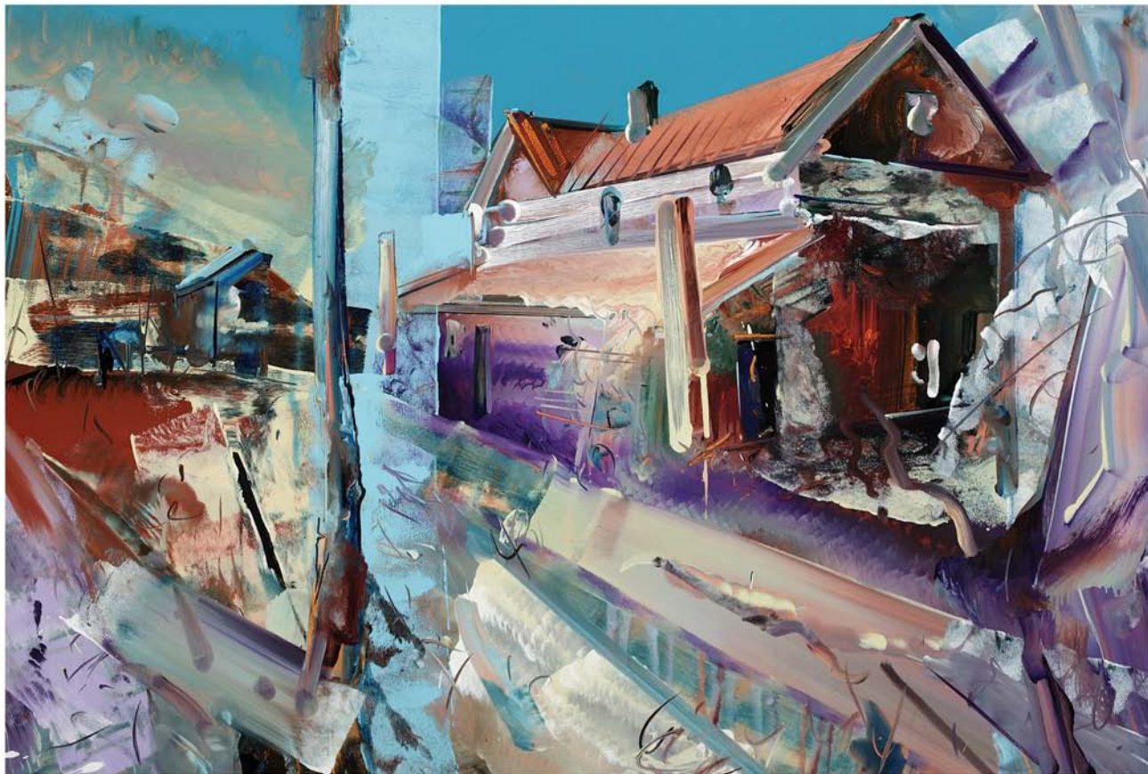
OSBORN HOUSE, 40X48 INCHES, OIL ON MI-TEINTES, 2011