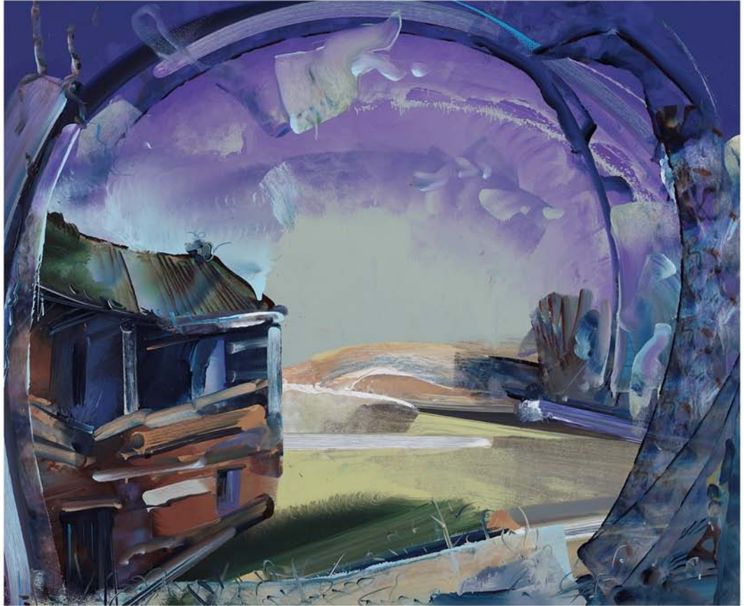
GOLDEN TRIANGLE WITH LOG HOUSE, 36X40 INCHES, OIL ON MI-TEINTES, 2011