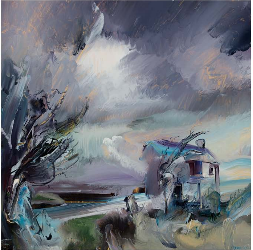
CABINTOWN, 26X28 INCHES, OIL ON MI-TEINTES, 1996