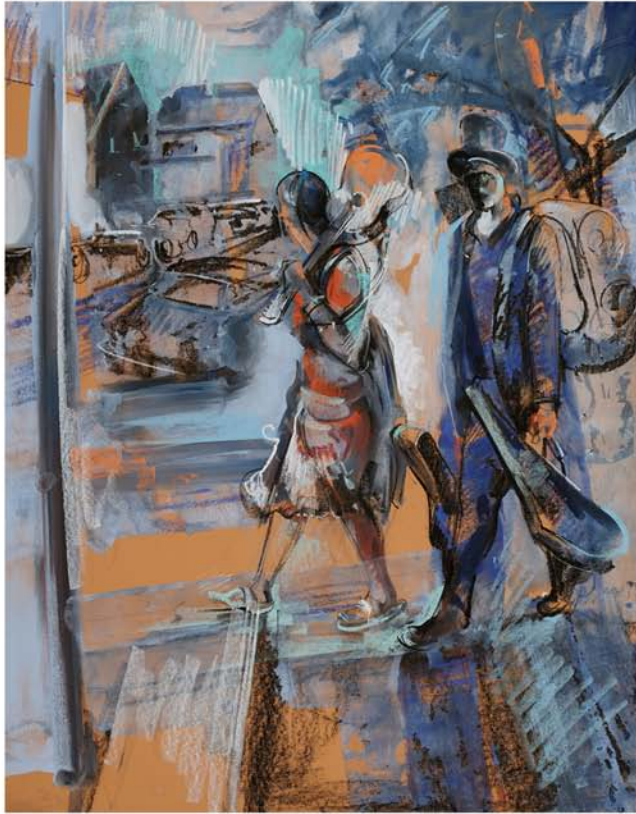
NORTHAMPTON SALTIMBANQUES, 40X30 INCHES, CHARCOAL & LIQUIFIED PASTEL ON MI-TEINTES, 2010