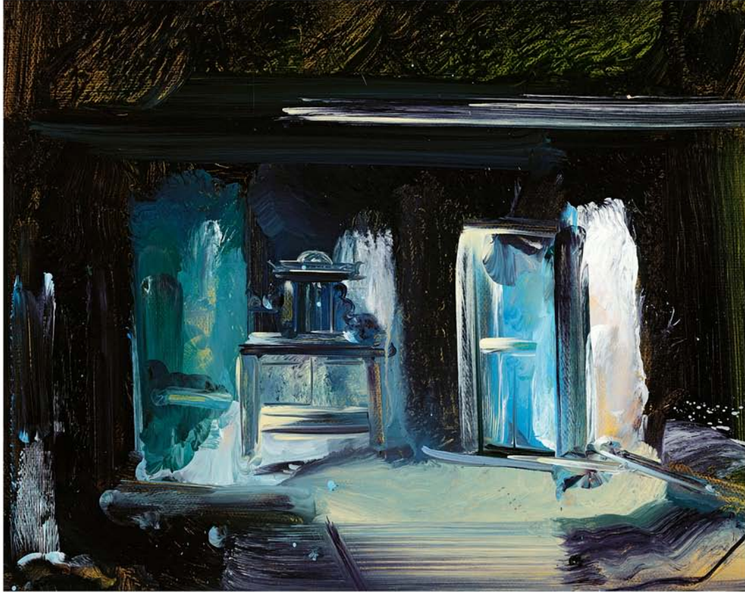
KILLBRIDE CHIFFONIER, 15X19 INCHES, OIL ON MI-TEINTES, 2004

BALLINGLEN ARTS FOUNDATION CO. MAYO, IRELAND: 1994-2005