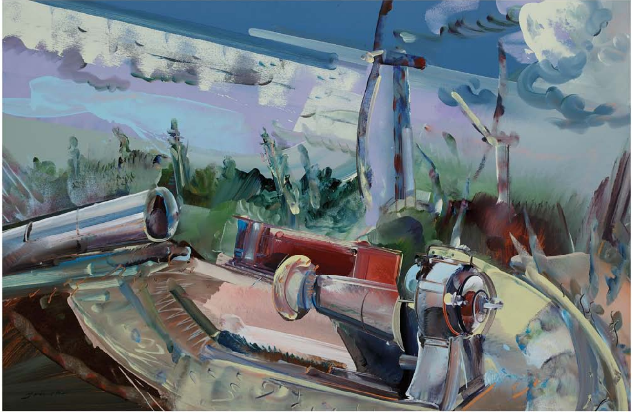
BROKEN WIND TURBINE, 30X48 INCHES, OIL ON MI-TEINTES, 2009