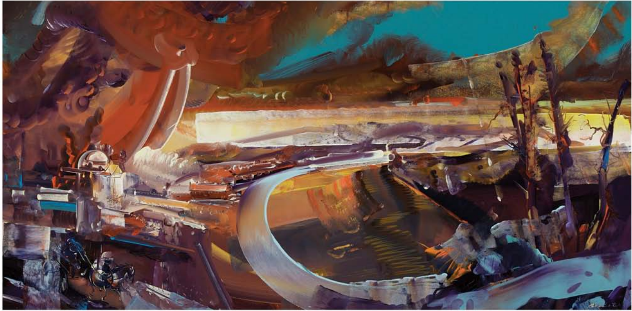
VERMONT STATE CAPITAL FIRE OF 1857: TEMPLE IN THE WILDERNESS, 35X70 INCHES, OIL ON GATORBOARD, 2011