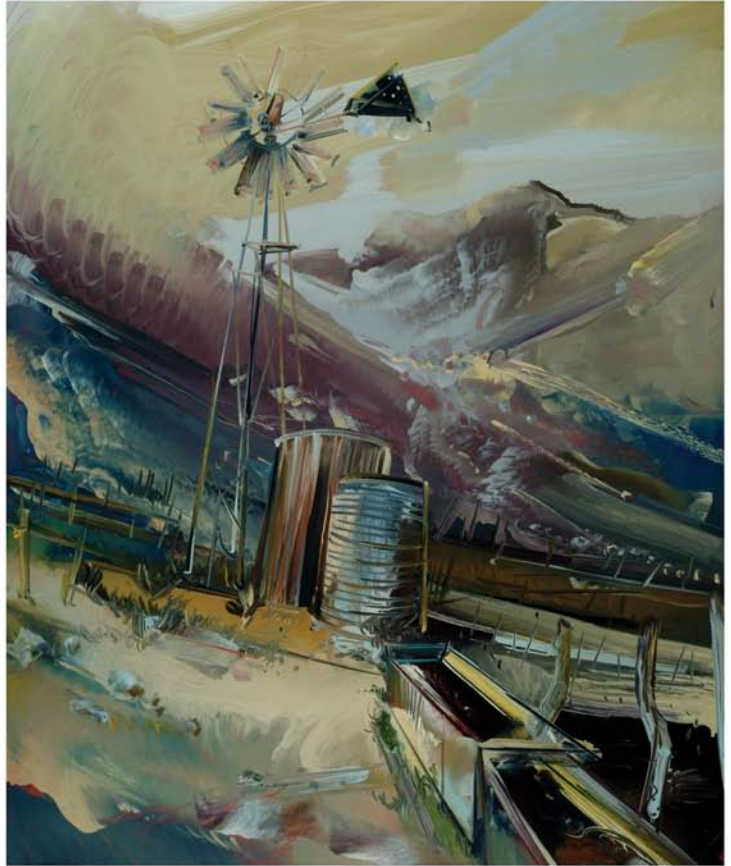
HORSE THIEF CANYON, 39X29 INCHES, OIL ON MI-TEINTES, 2007